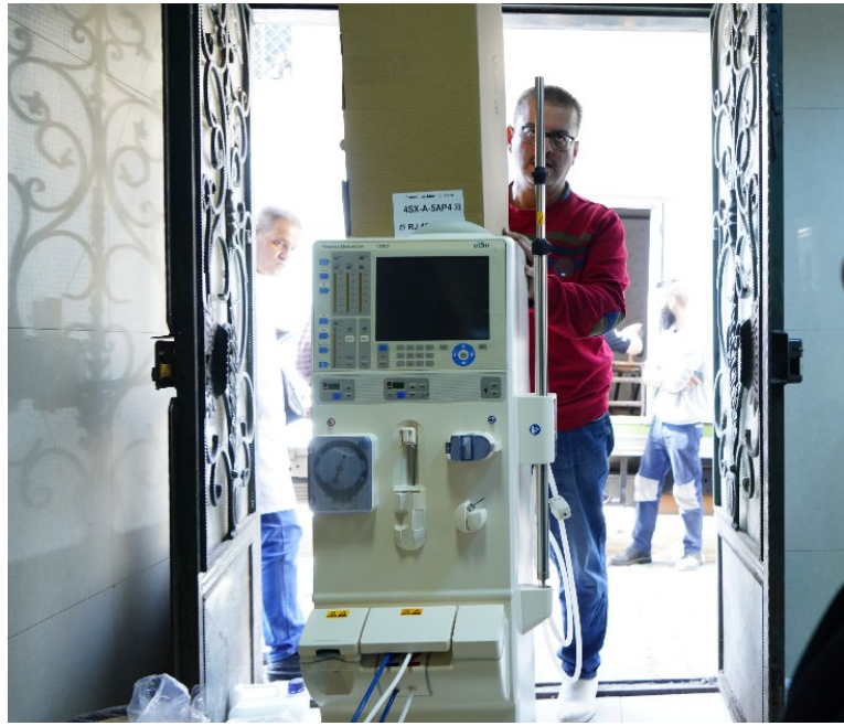
International Medical Corps donated a much-needed kidney dialysis machine to Al Mojtahid Hospital in Damascus.

Ongoing hostilities across Syria continue to result in civilian casualties, displacement and severe restrictions on humanitarian access.