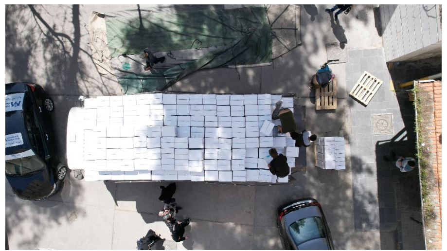
International Medical Corps has donated medical consumables to Al Mojtahid Hospital in Damascus.

To support national health strategies and maximize resources, we work closely with key stakeholders—including the DoH, MoH and the World Health Organization—to ensure that critical assistance reaches the most vulnerable populations. Since the beginning of our response, we have provided 61,421 health consultations, including 13,792 reproductive-health consultations; facilitated 1,954 referrals to