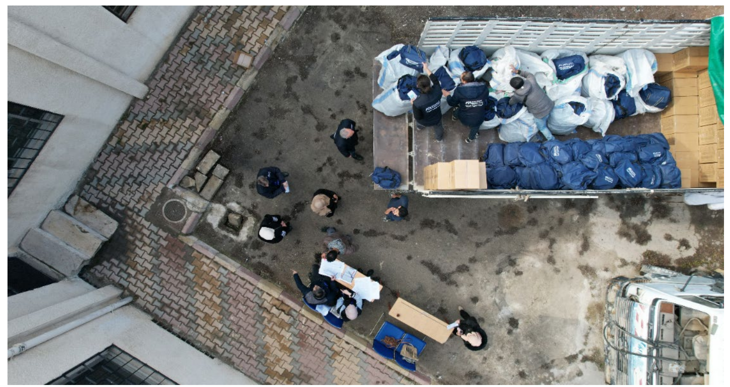
International Medical Corps staff prepare for distribution of hygiene, winterization and dignity kits in Rural Damascus.

To support national health strategies and maximize resources, International Medical Corps works closely with key stakeholders—including the DoH, MoH and WHO—to ensure that critical assistance reaches the most vulnerable populations. Since November, we have provided 34,061 health consultations, distributed 864,675 medications, delivered 1,931 MHPSS services and offered 2,288 protection services. These initiatives underscore our dedication to meeting urgent needs while contributing to the long-term strengthening of Syria's healthcare system.