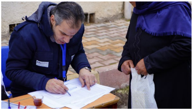
A staff member distributes hygiene kits in Rural Damascus.

Hostilities persist across Syria, particularly in the northeastern region, affecting Aleppo, Ar Raqqa, the Tishreen Dam, and the Al Hasakeh and Ar Raqqa governorates. Clashes in Menbij have recently displaced 25,000 people, increasing the total number of displaced to 652,000. Tribal clashes and looting in coastal areas have restricted civilian movement, while Israeli incursions in the south have been reported in Quneitra.