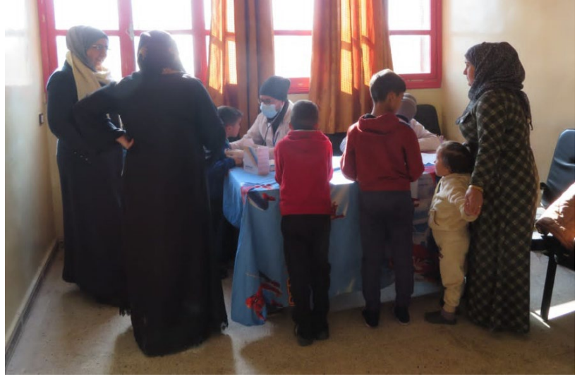
International Medical Corps staff provide essential healthcare services to the local population in Tabqa.

Syria Emergency Response Situation Report #5 January 16, 2025