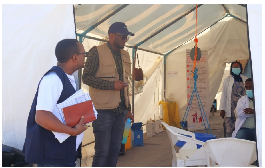
International Medical Corps staff members visit a health clinic at the Diado IDP site in the Amibara woreda (district).

Seismic activity continues in the Afar and Oromia regions of Ethiopia, particularly in the Awash, Dulecha and Fentale districts. From January 4–16, at least 50 earthquakes with magnitudes ranging from 4.2 to 5.8 were recorded. These tremors are linked to the Fentale volcanic complex in the Main Ethiopian Rift, which has shown gradual ground deformation since 2021. The surge in activity since late December 2024 has caused steam vents to release gases and steam, likely due to movement of magma.