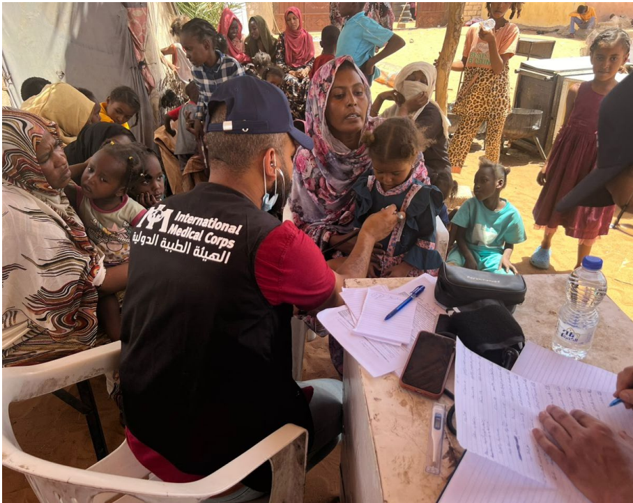
An International Medical Corps doctor examines a newly arrived child in Kufra city, in the southern region of Libya.

Since the conflict erupted in Sudan in mid-April 2023, some 10 million people have been displaced, with more than 2 million fleeing to neighboring countries. Most Sudanese migrants in Libya settle in Kufra, a sparsely populated region that is predominantly desert. This surge of Sudanese refugees into Libya has created an urgent humanitarian crisis. 1