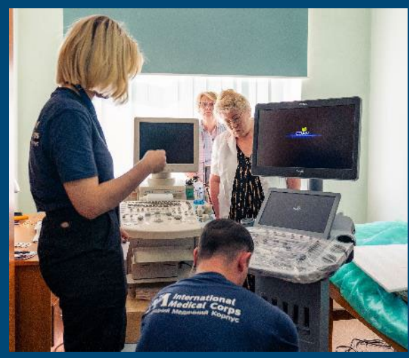
Members of International Medical Corps' Health team set up medical equipment in one of the healthcare facilities that we support in Mykolaivska oblast.