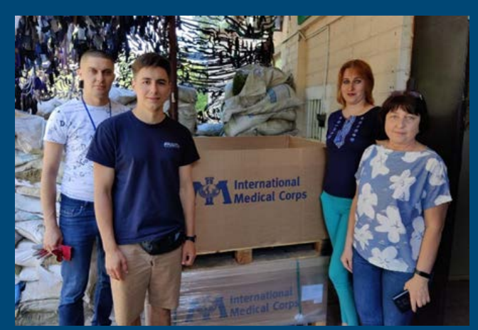
International Medical Corps staff members donate infection prevention and control kits to the Apostolove District Hospital, in Dnipropetrovska oblast.

More than one month has passed since the destruction of the Kakhovka Dam and subsequent catastrophic flooding. International Medical Corps continues to support affected populations. In June, we: