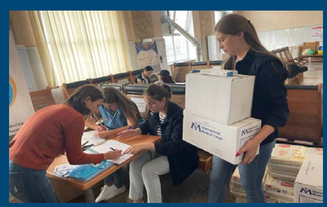
International Medical Corps team distribute dignity kits for displaced women and adolescent girls at the Odesa train station after the Kakhovka Dam disaster.

During June, International Medical Corps provided GBV prevention and response services directly and through local women's rights organization partners. We reached affected women, adolescent girls and communities directly to raise awareness of GBV and conduct recreational PSS activities in communities in Lvivska, Kharkivska, Kyivska and Odeska oblasts.