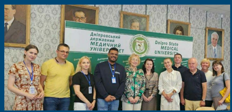
International Medical Corps staff members meet with representatives of Dnipro State Medical University.

In June, the International Medical Corps Training Team: