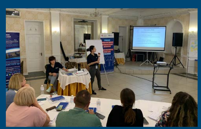
International Medical Corps MHPSS team members conduct psychological first aid training in Mykolaiv.

In June, International Medical Corps continued to implement MHPSS activities across Ukraine, including the following.