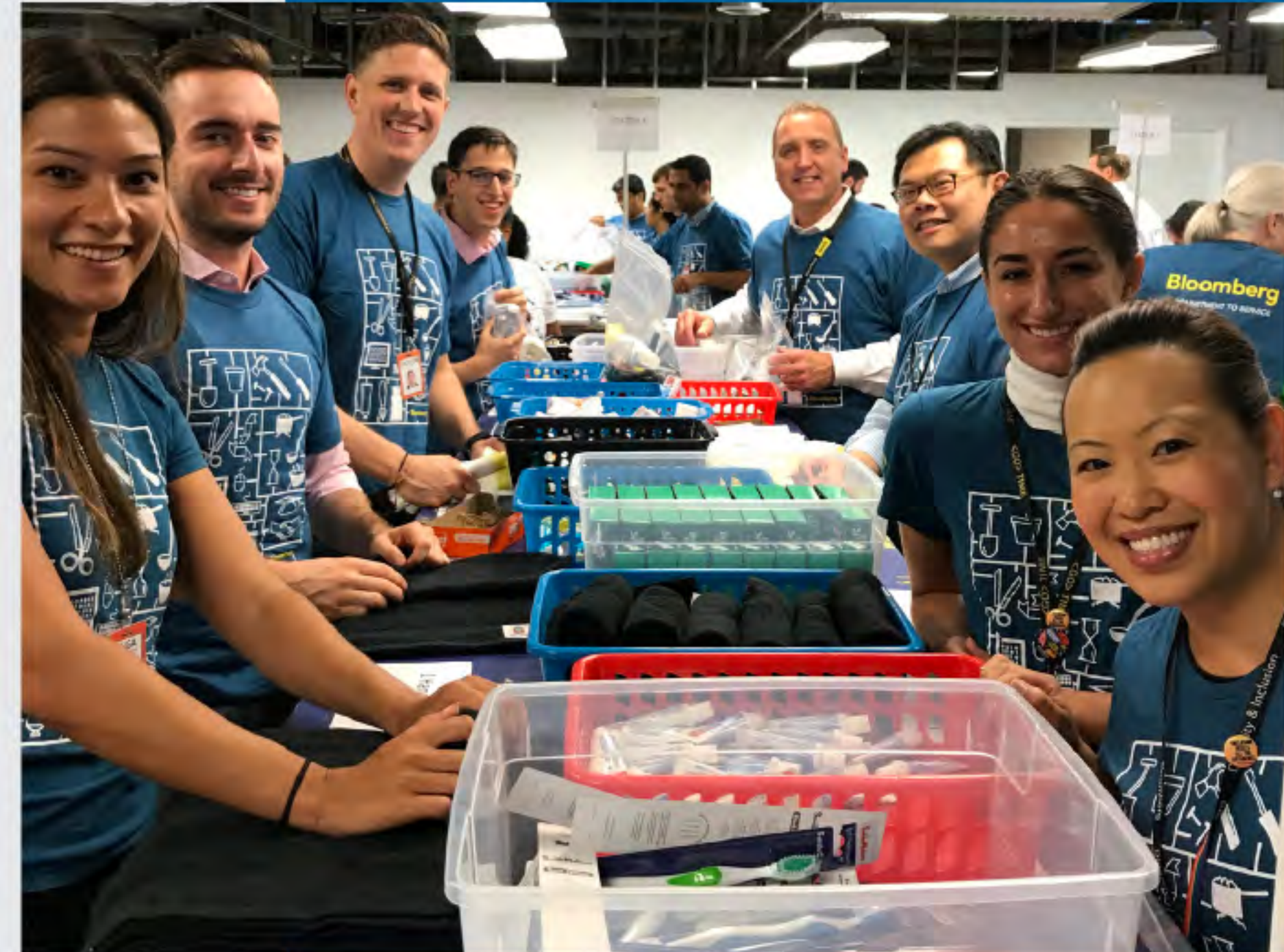
Bloomberg volunteers helping International Medical Corps with Hurricane Florence relief efforts, September 2018.

We are proud to support the International Medical Corps